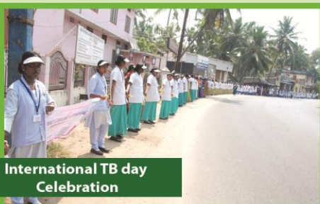
International TB day Celebration