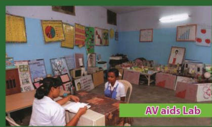
AV aids Lab