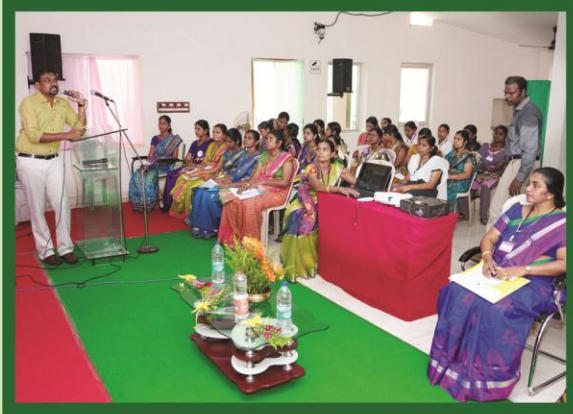
Diploma in General Nursing and Midwifery - 3½ years

Approved by Government of Tamilnadu, Recognized by INC/TNMC