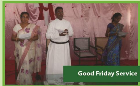
Good Friday Service

The college alumni was designed and activated on January 2015 with 250 alumni members at present. They all registered and actively participating in all the alumni events. The association is planned to conduct various programmes including workshop, conference, seminars, alumni get together. Also the institution has the plan of releasing annual newsletters that facilitate the members to update the happenings of the institution.