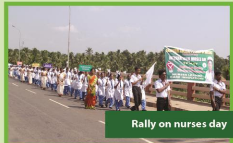
Rally on nurses day