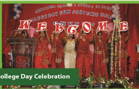
College Day Celebration