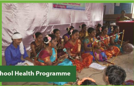
School Health Programme